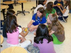
Brown School students in an interactive exercise.